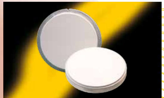
Discs with polymer ring

Ø 112mm + Ø 98,3mm - 10mm / 12mm / 14mm / 16mm / 18mm / 20mm / 25mm