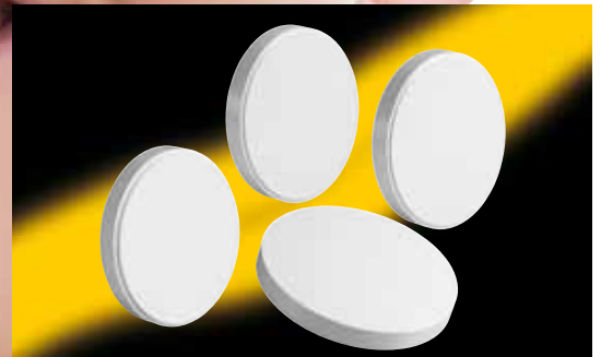
Zeno ™ compatible

5-er (16mm) / 9-er (16mm) / 16-er (16mm) / 5-er (22mm) / 9-er (22mm) / 16-er (22mm)