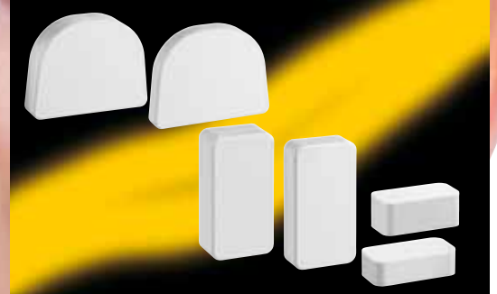
ZirkonZahn ™ compatible

5-er (16mm) / 9-er (16mm) / 16-er (16mm) / 5-er (22mm) / 9-er (22mm) / 16-er (22mm)